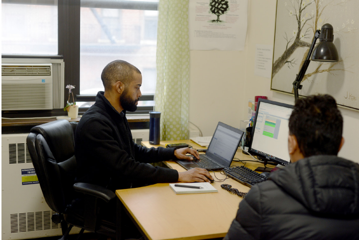
One-on-one financial counseling with a trained financial coach

2751 Grand Concourse, Bronx, NY 10468 P: 718.933.3101 • F: 718.933.3624 • www.unhp.org